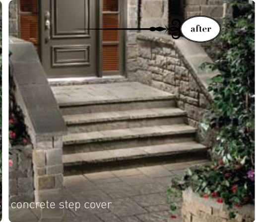
concrete step cover